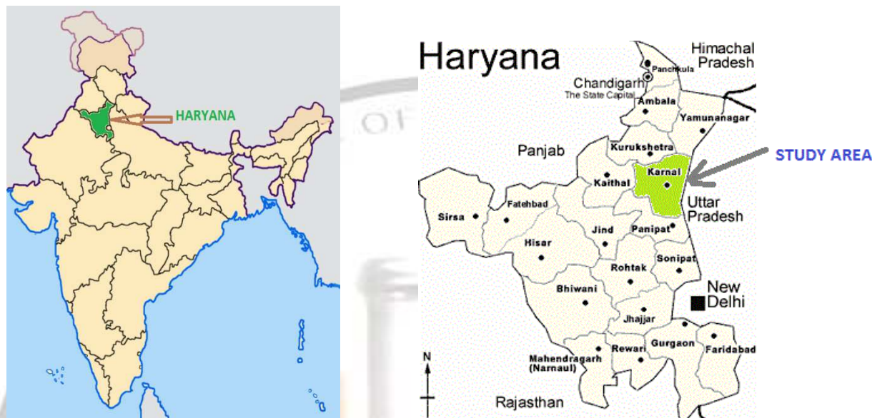
Fig. 1: Map of Study area